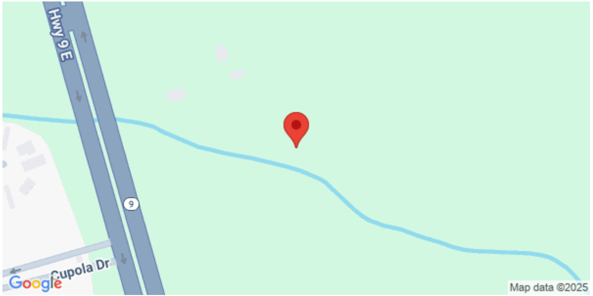
TBD Highway 9, Longs, 29568, SC