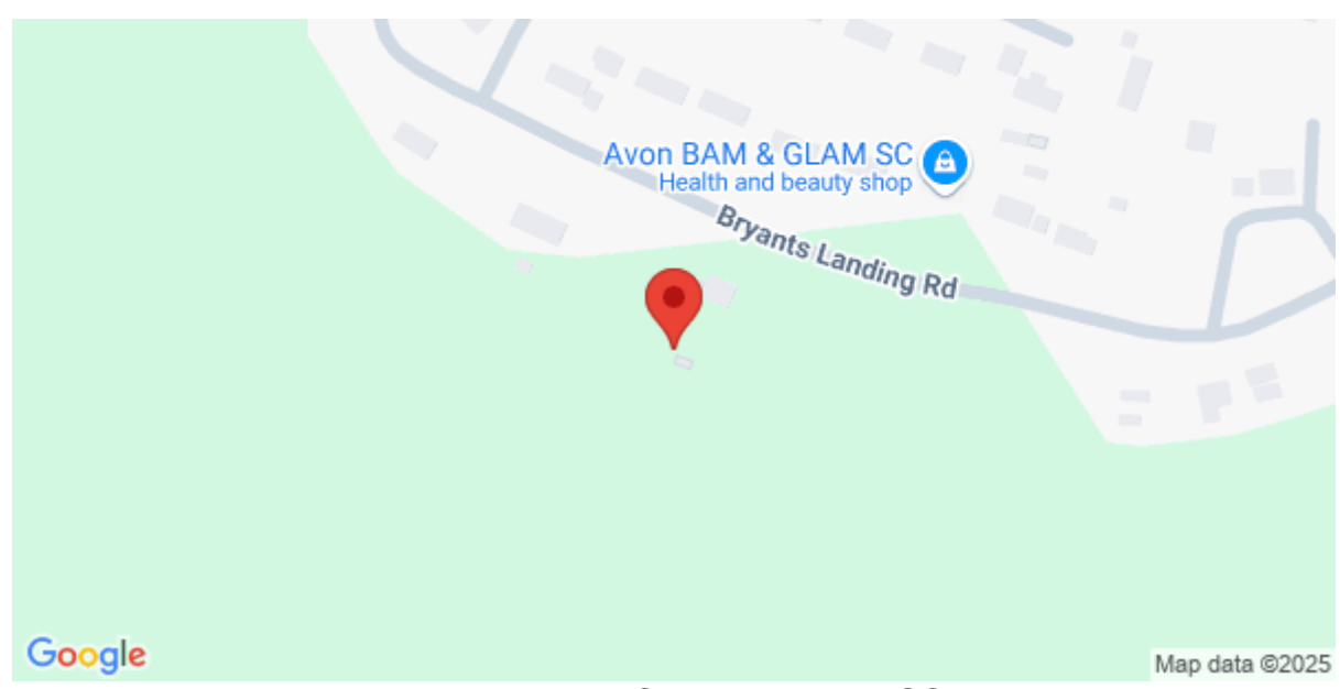
Mill Pond Rd., Conway, 29526, SC