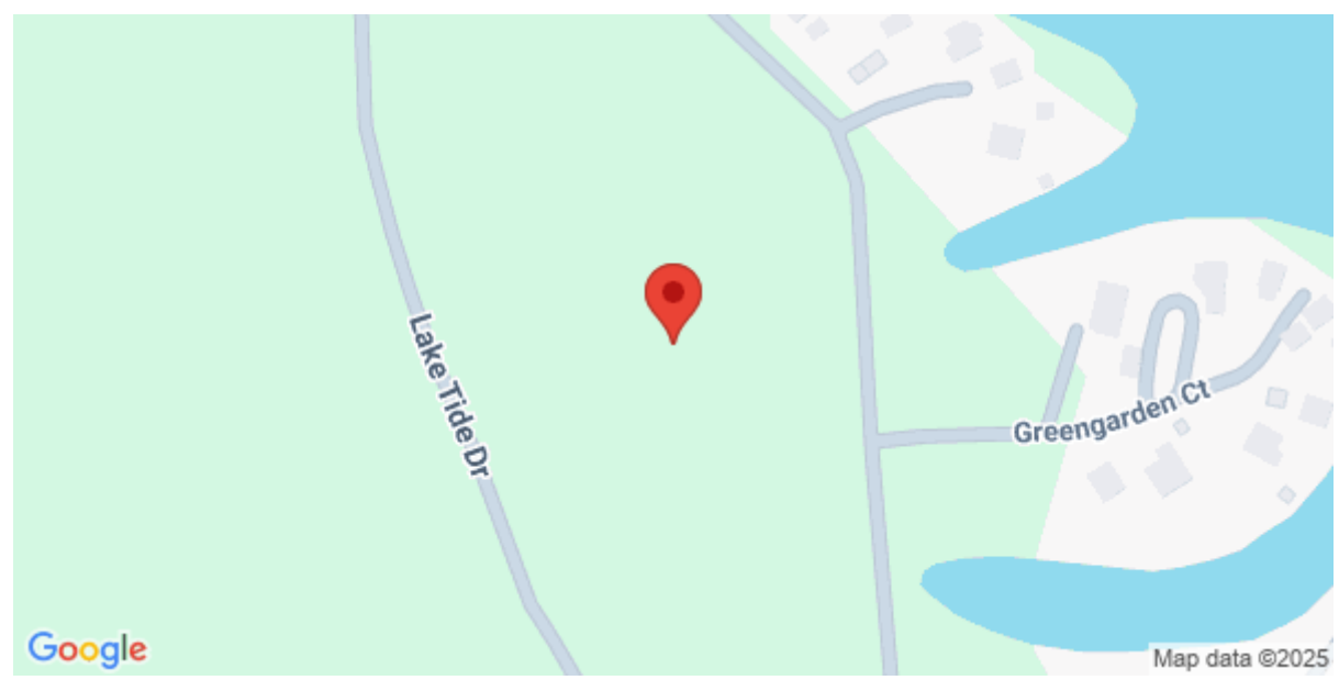
Greengarden, Chapin, 29036, SC