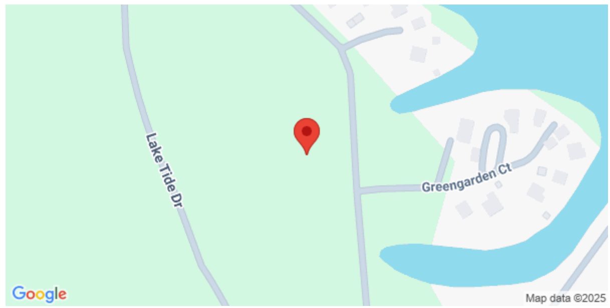
Greengarden, Chapin, 29036, SC