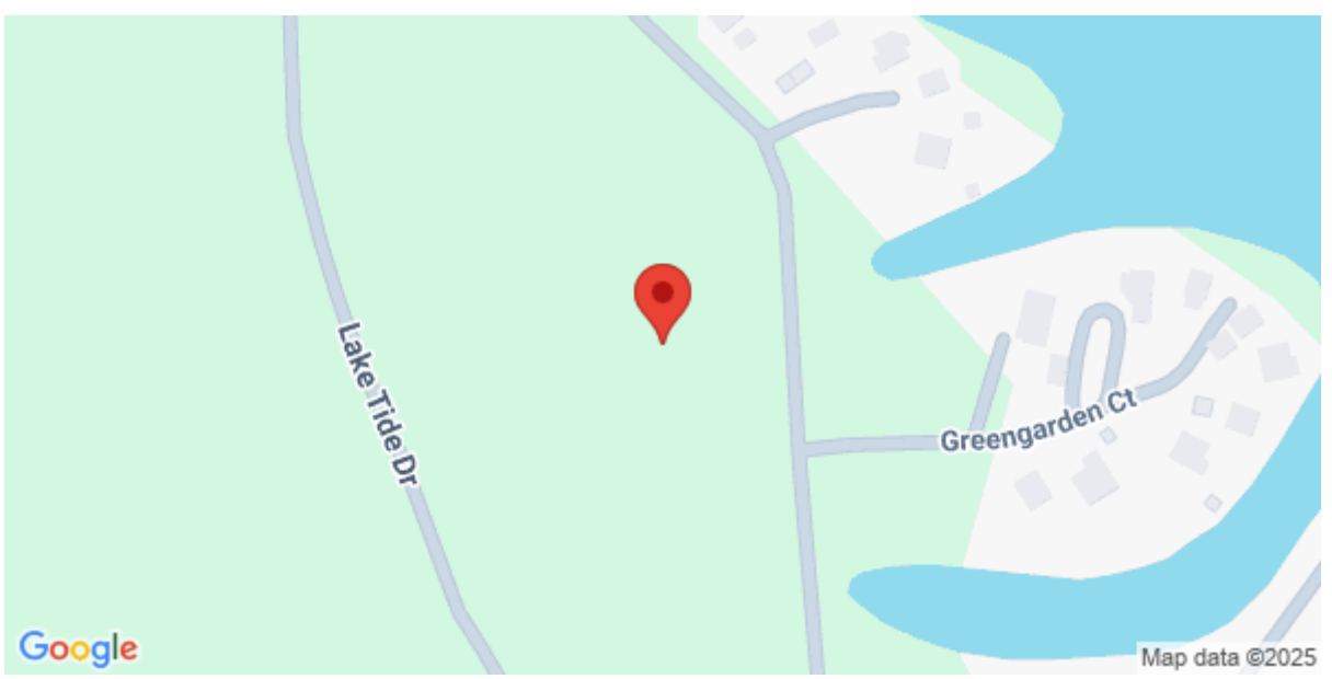
Greengarden, Chapin, 29036, SC