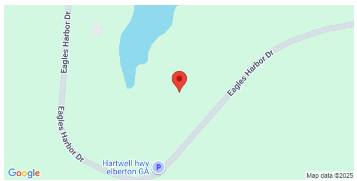
930 Eagles Harbor Drive, Hodges, 29653, SC