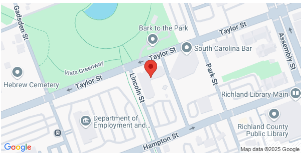
900 Taylor, Columbia, 29201, SC