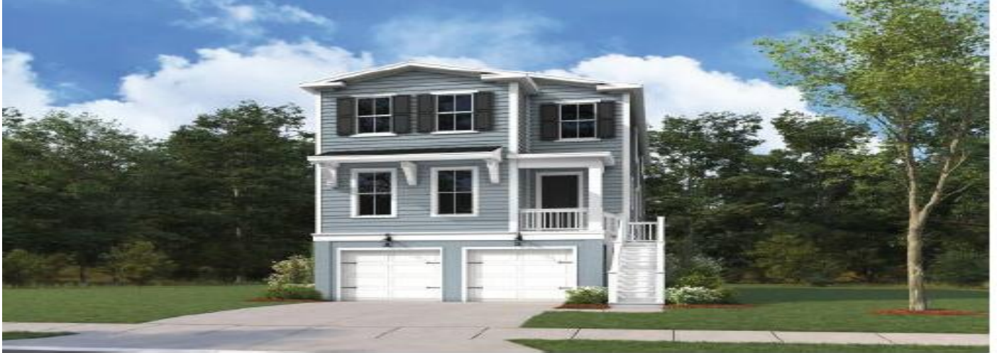
ELEVATION B ✓

https://searchrealestate.co/properties/744-minton-road/charleston/sc/29412/MLS_ID_25007724