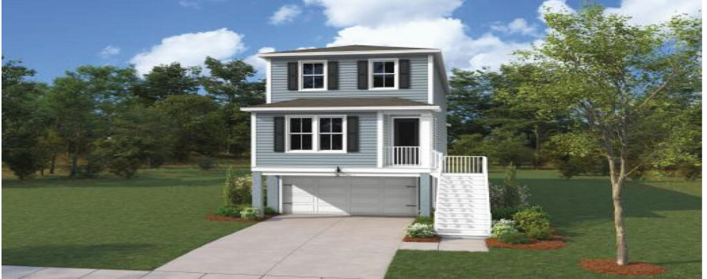
ELEVATION A ✓

https://searchrealestate.co/properties/724-minton-road/charleston/sc/29412/MLS_ID_25007666