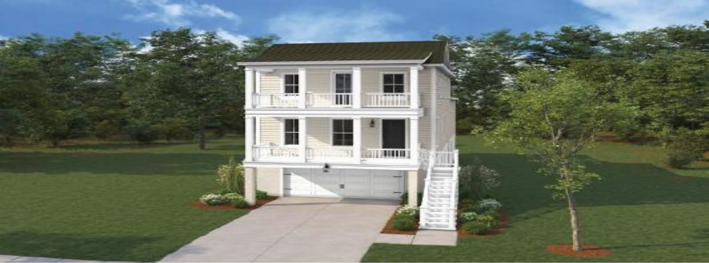
ELEVATION B ✓

https://searchrealestate.co/properties/722-minton-road/charleston/sc/29412/MLS_ID_25007665