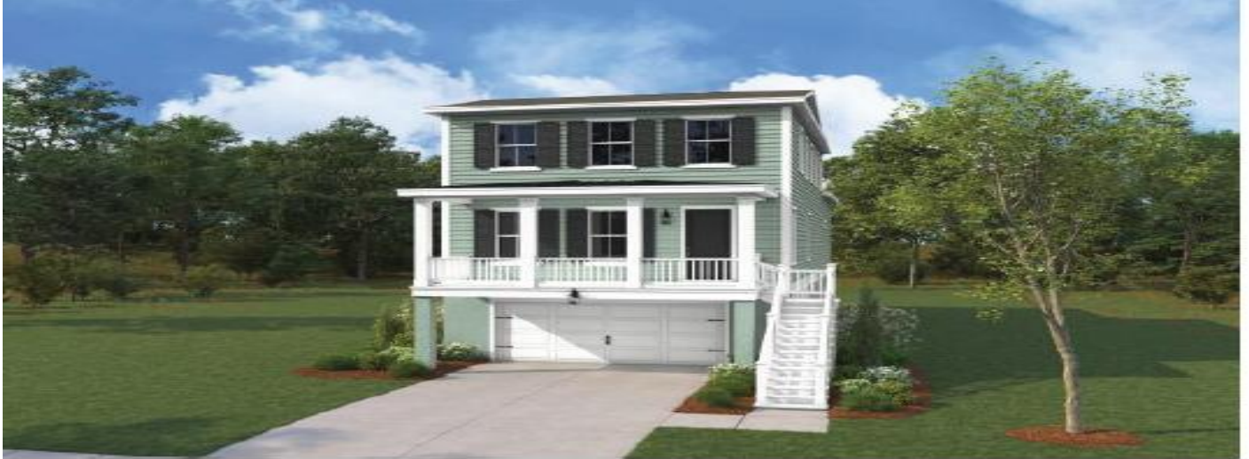
ELEVATION C ✓

https://searchrealestate.co/properties/720-minton-road/charleston/sc/29412/MLS_ID_25007659