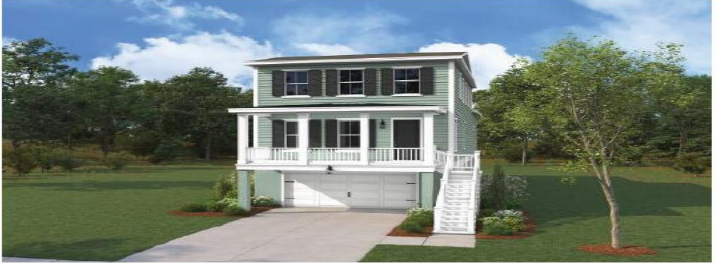
ELEVATION C ✓

https://searchrealestate.co/properties/712-minton-road/james-island/sc/29412/MLS_ID_25007608