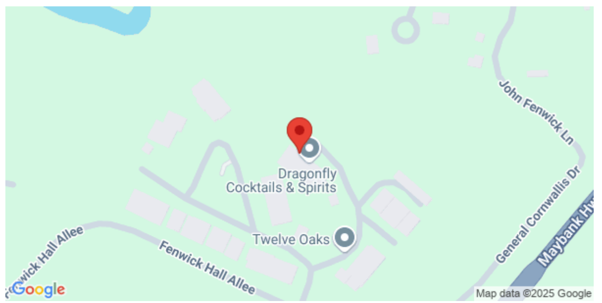
60 Fenwick Hall Allee, Johns Island, 29455, SC