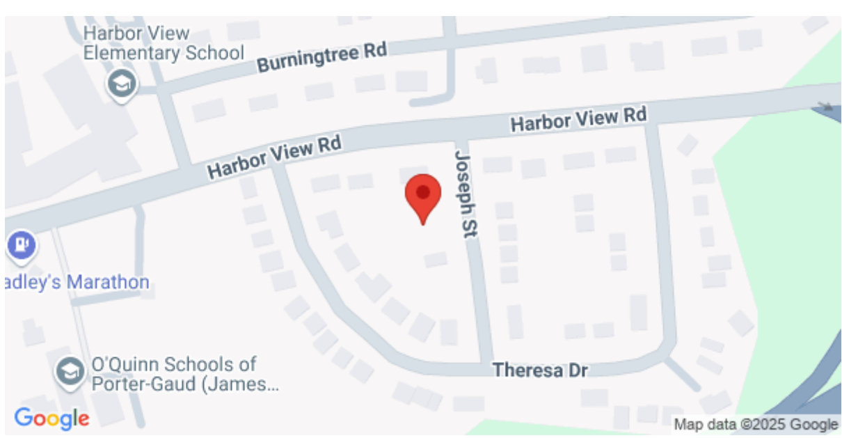
515 Joseph Street, Charleston, 29412, SC