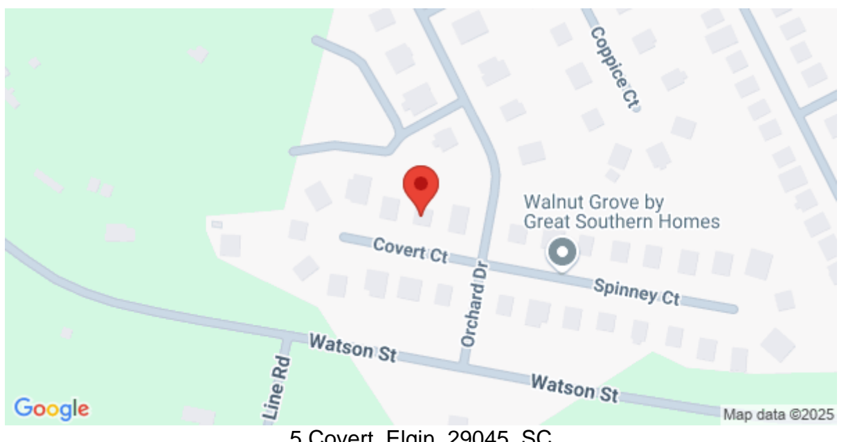
5 Covert, Elgin, 29045, SC