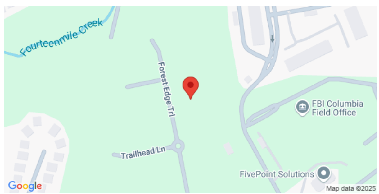
472 Forest Edge, Lexington, 29072, SC