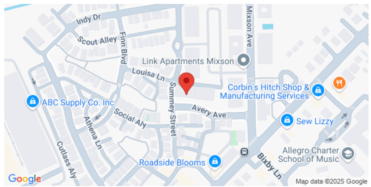
4404 Avery Avenue, North Charleston, 29405, SC