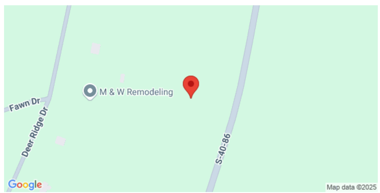
42 Harmon Road, Hopkins, 29061, SC