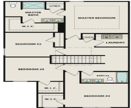
Upper Floor Plan