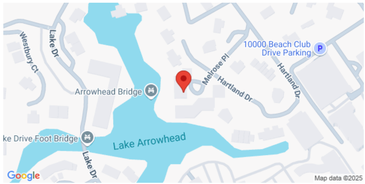
410 Melrose Pl., Myrtle Beach, 29572, SC