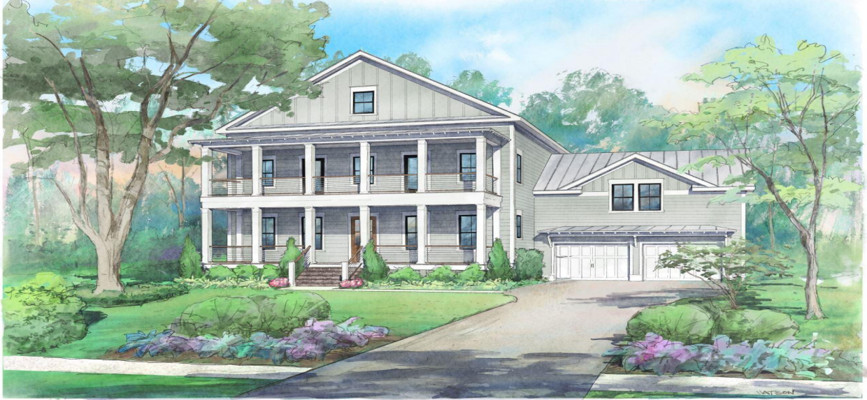
3845 DELINGER DR

https://searchrealestate.co/properties/3845-delinger-drive/mount-pleasant/sc/29466/MLS_ID_25006391