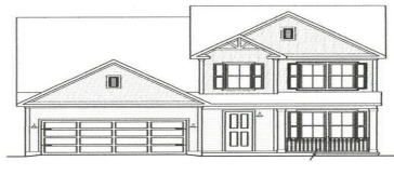
ELEVATION B EMERSON - 2386