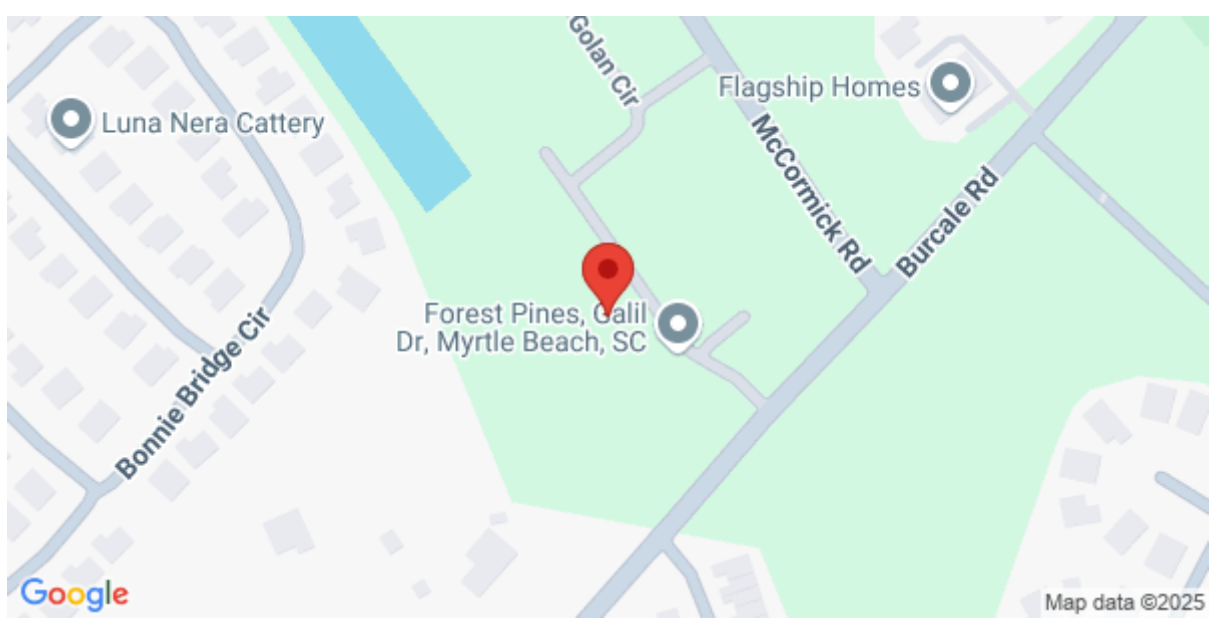
325 Golan Circle, Myrtle Beach, 29579, SC