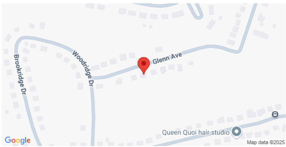
322 Glenn, Columbia, 29203, SC