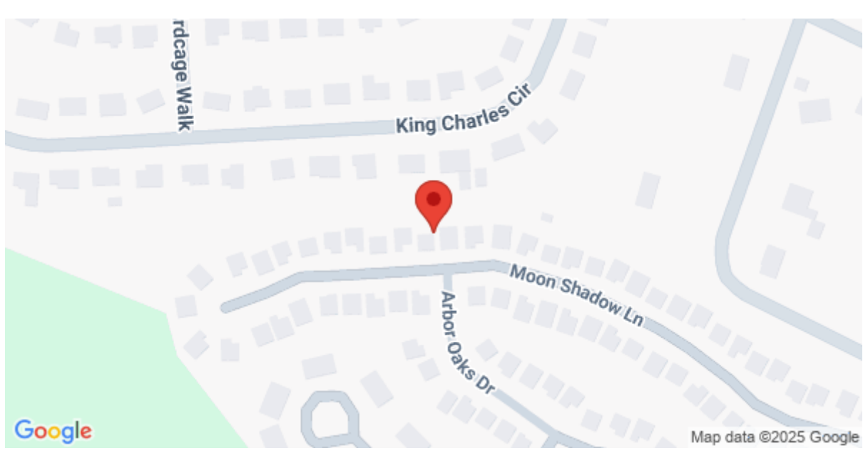
315 King Charles Circle, Summerville, 29485, SC