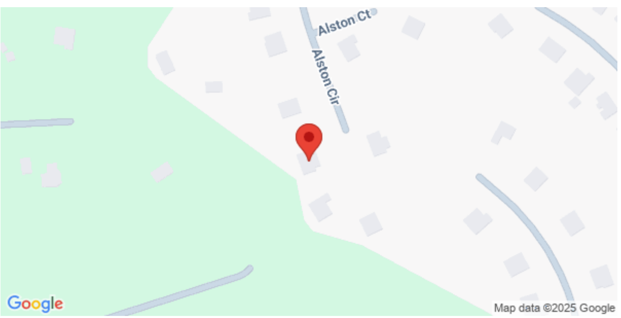
306 Alston, Lexington, 29072, SC