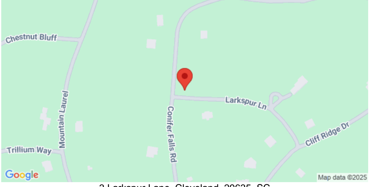
3 Larkspur Lane, Cleveland, 29635, SC