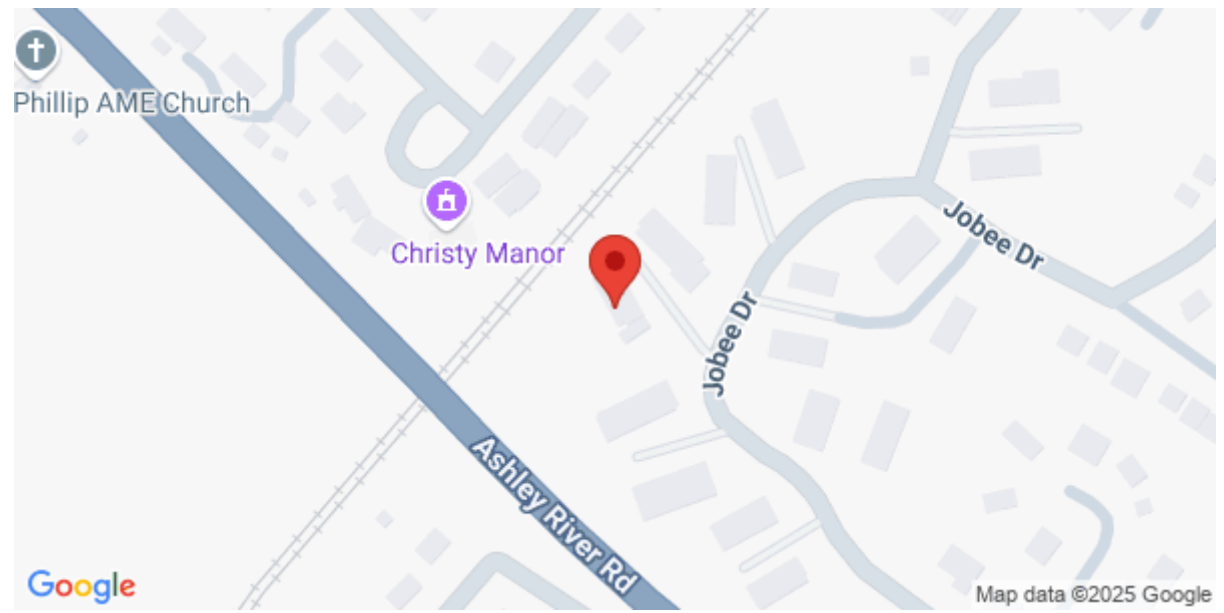
2757 Jobee Drive, Charleston, 29414, SC