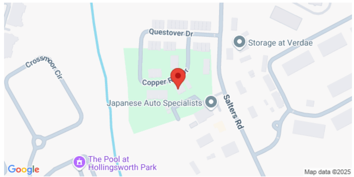
27 Copper Run Drive, Greenville, 29607, SC