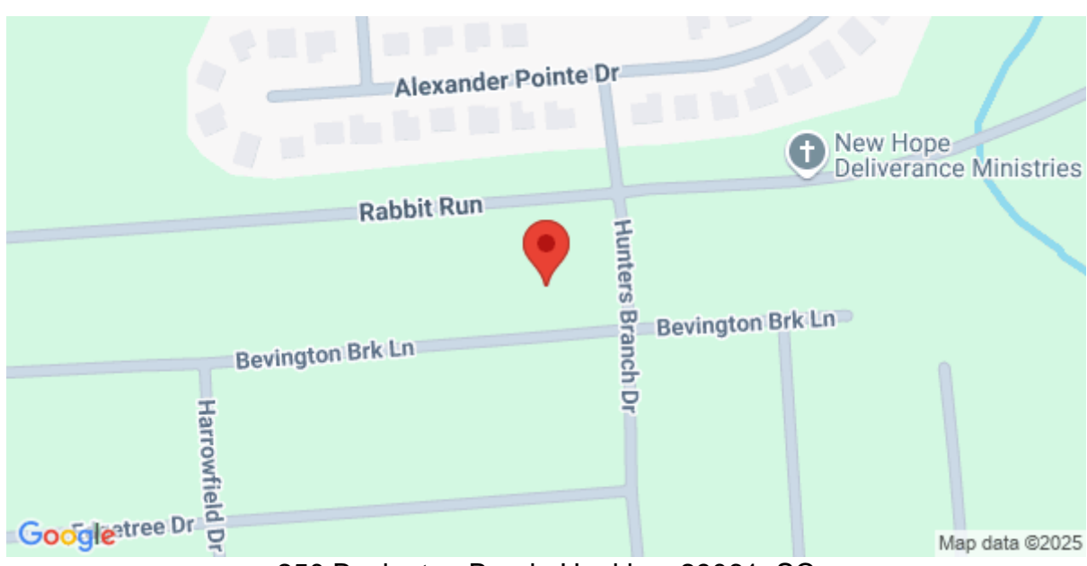
250 Bevington Brook, Hopkins, 29061, SC