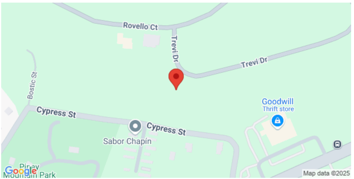
233 Trevi Drive, Greenville, 29609, SC