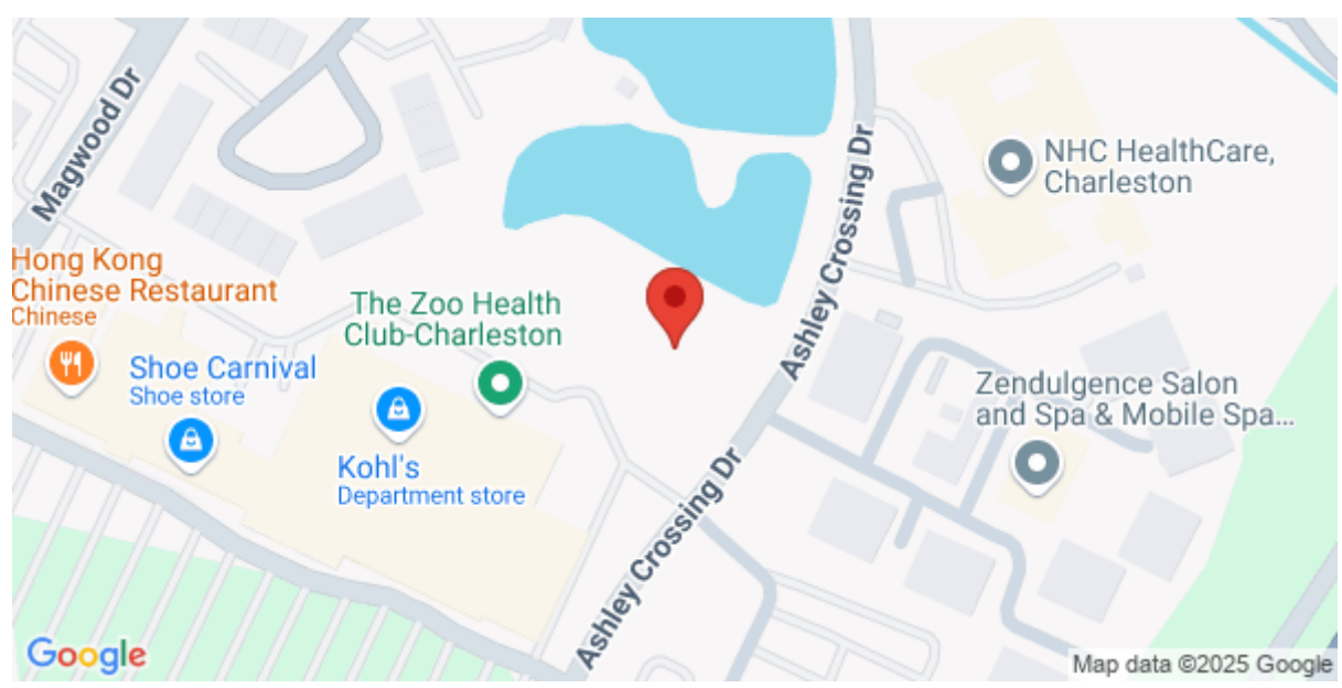
2241 Ashley Crossing Drive, Charleston, 29414, SC