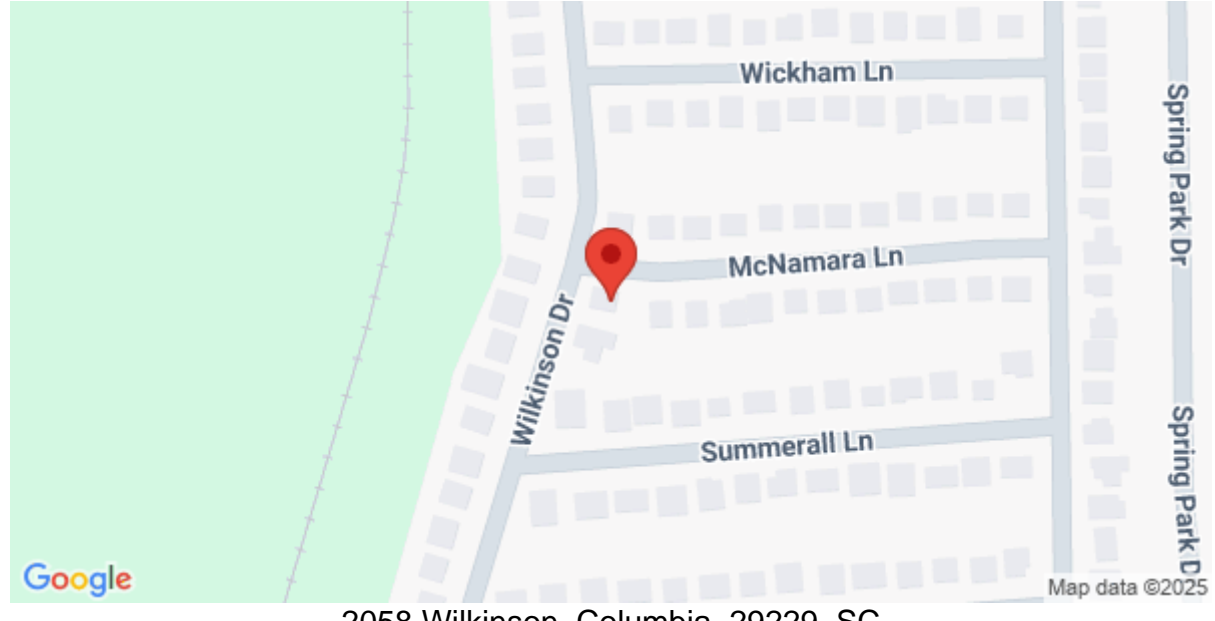
2058 Wilkinson, Columbia, 29229, SC