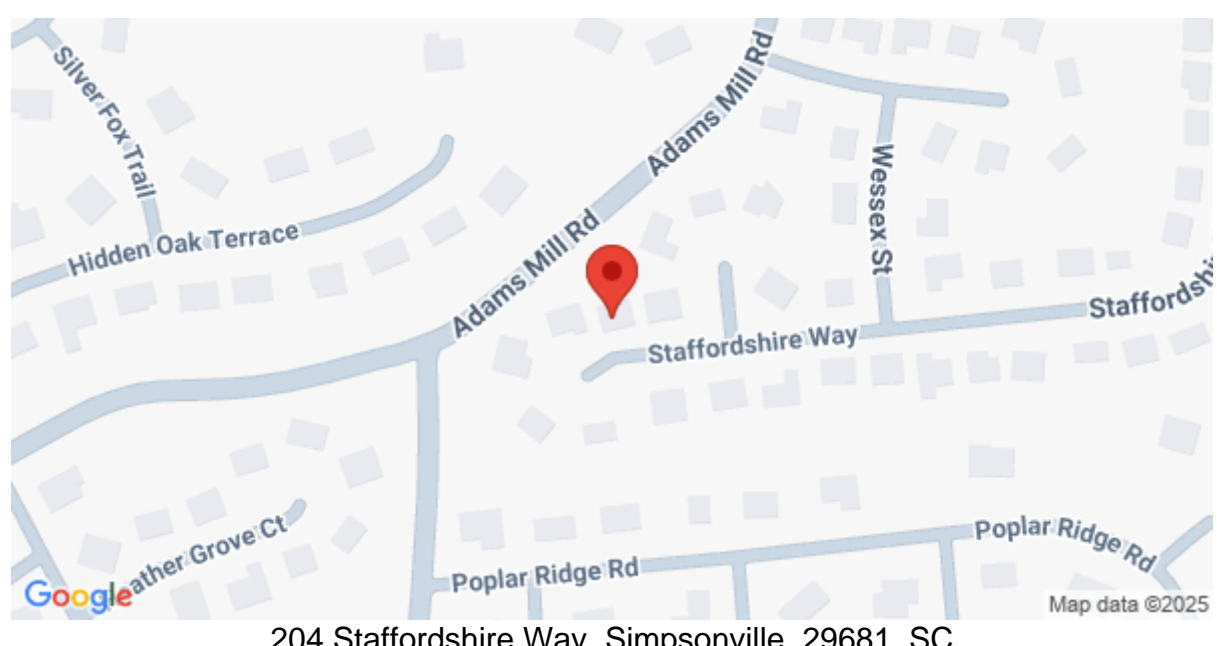
204 Staffordshire Way, Simpsonville, 29681, SC