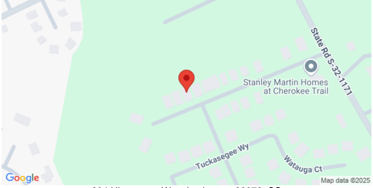
204 Hiawassee Way, Lexington, 29072, SC