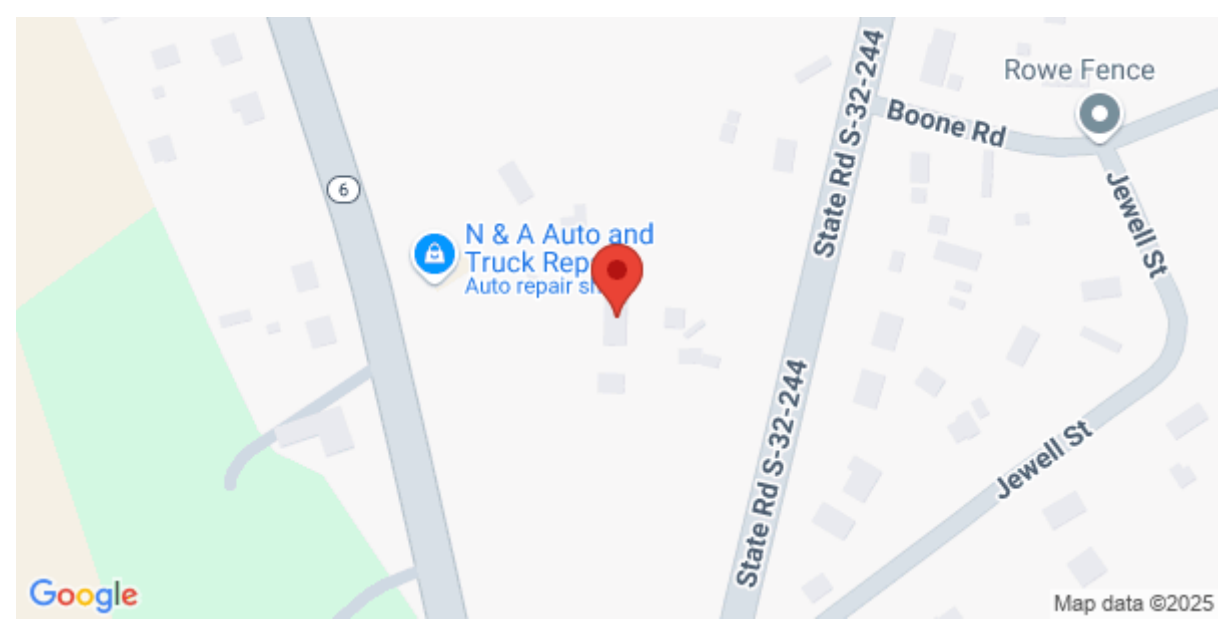
1981 Lake, Lexington, 29073, SC