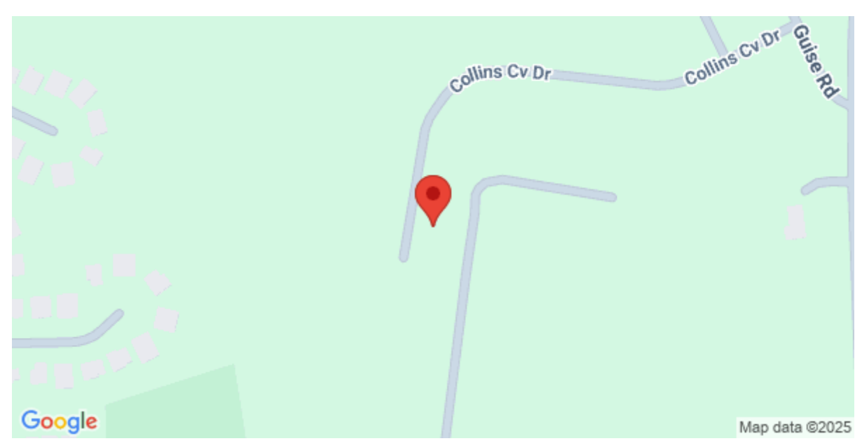
191 Collins Cove, Chapin, 29036, SC