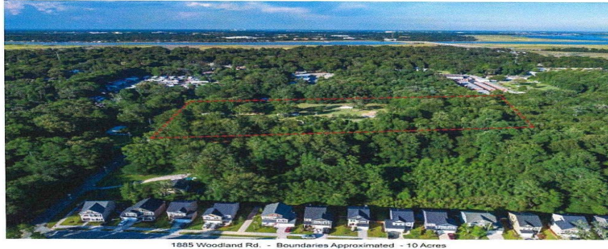
1885 Woodland Rd. - Boundaries Approximated - 10 Acres

https://searchrealestate.co/properties/1885-woodland-road/charleston/sc/29414/MLS_ID_21008760