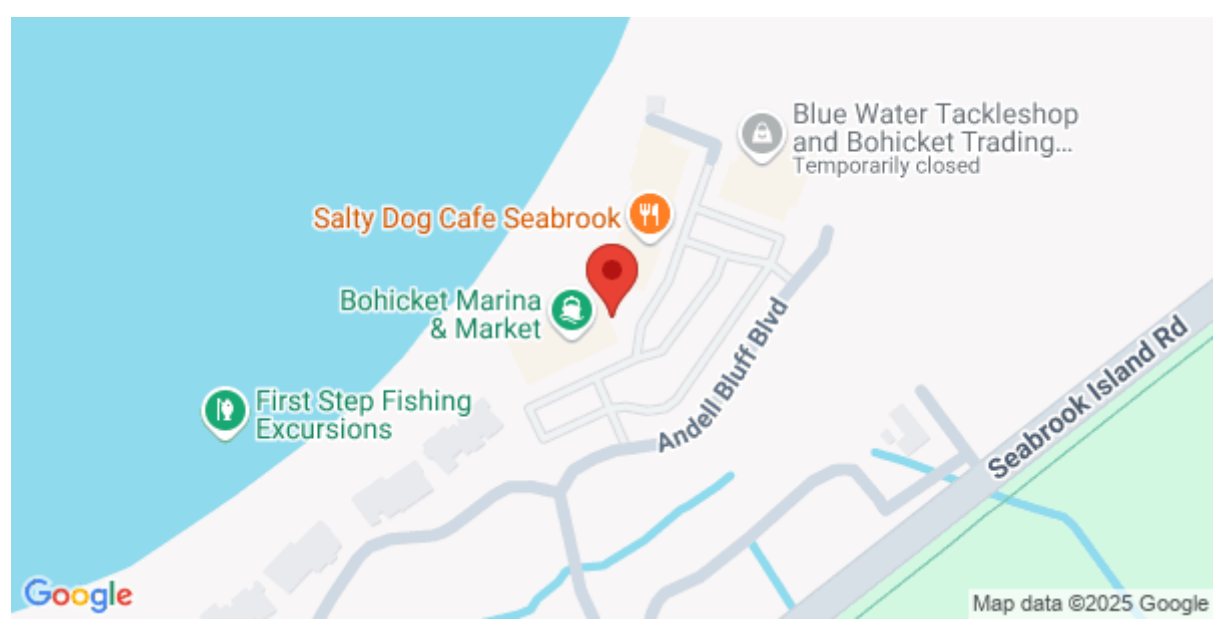
1880 Andell Bluff Boulevard, Seabrook Island, 29455, SC