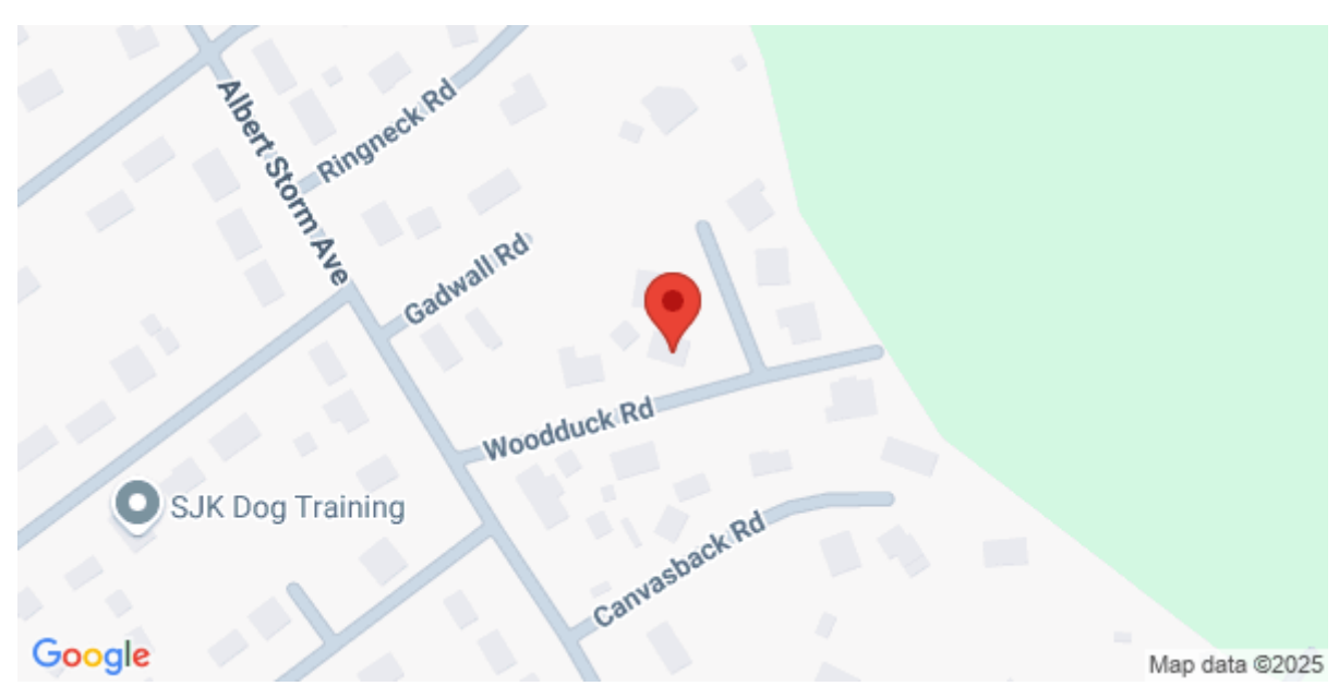
1805 Wood Duck Road, Moncks Corner, 29461, SC