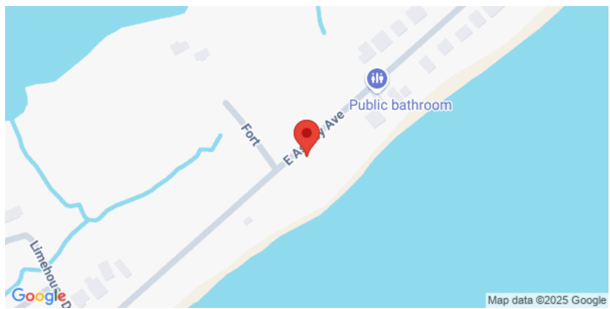
1579 Ashley Avenue, Folly Beach, 29439, SC