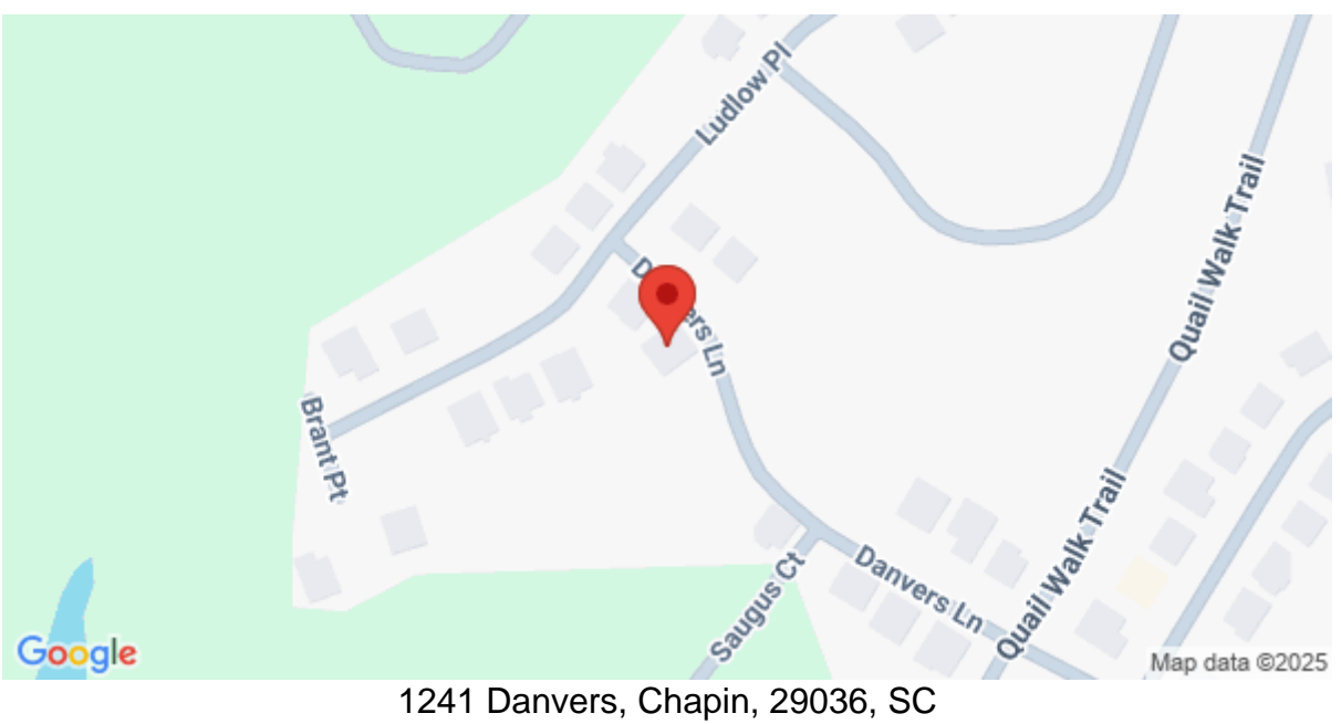
1241 Danvers, Chapin, 29036, SC