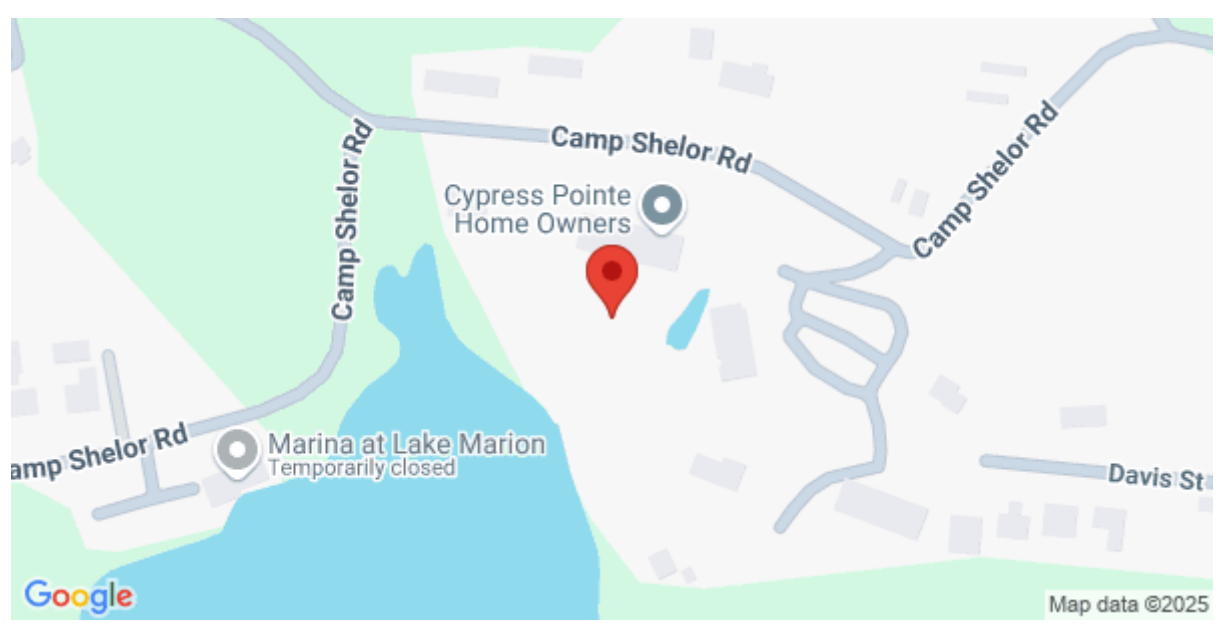
1205 Cypress Pointe, Manning, 29102, SC