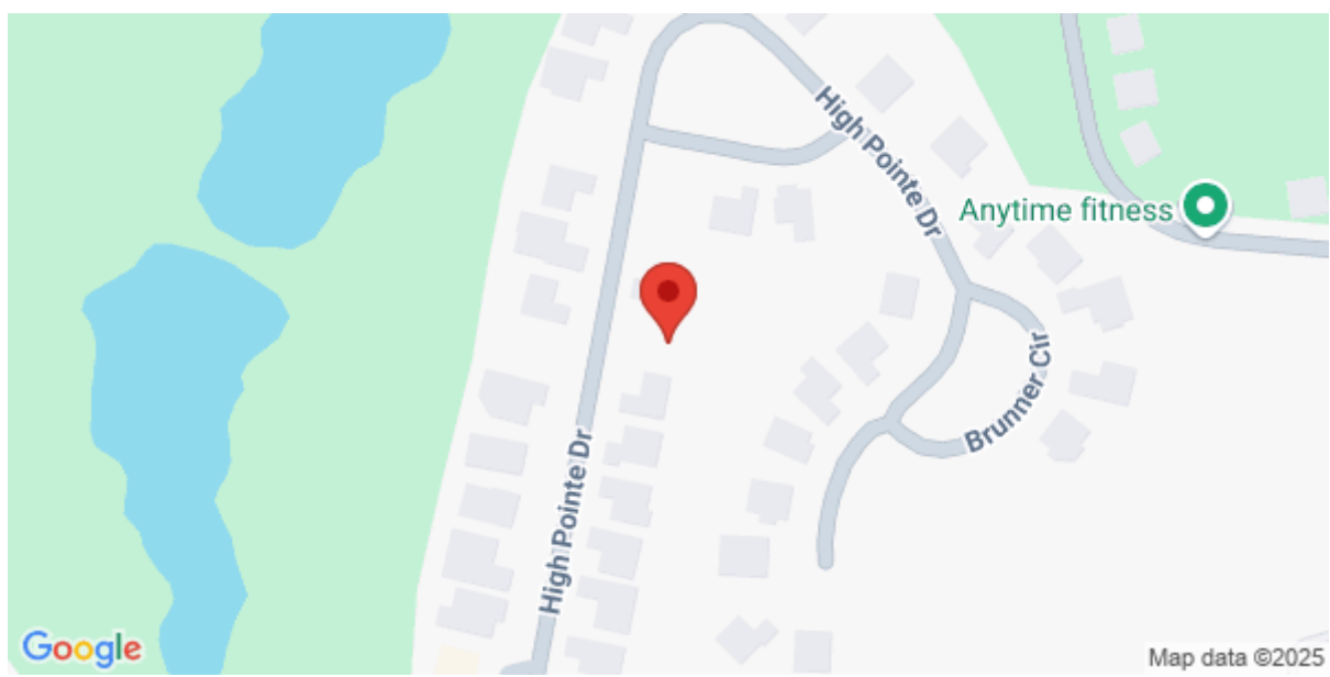
116 High Pointe, Blythewood, 29016, SC