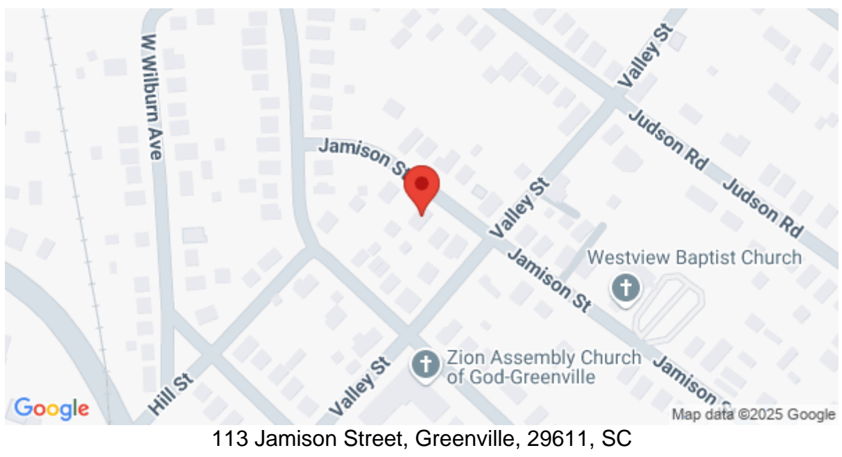
113 Jamison Street, Greenville, 29611, SC