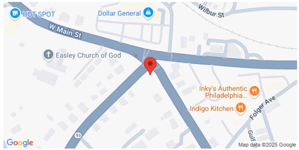
110 Textile Court, Easley, 29640, SC