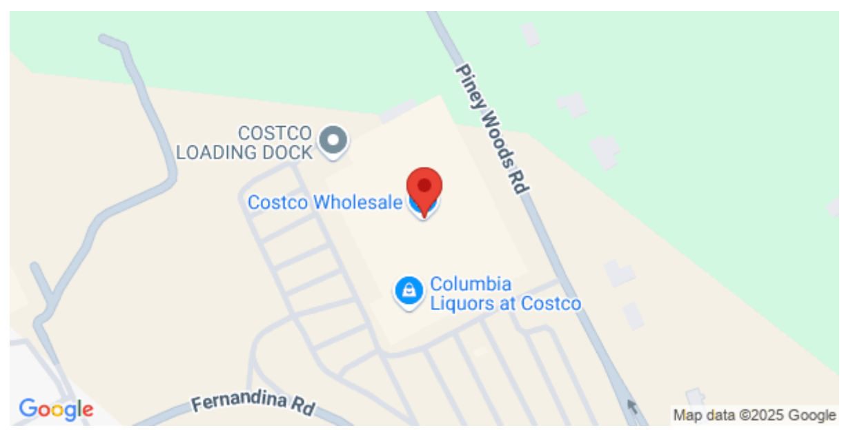
105 Prairie Grass Way, Columbia, 29212, SC