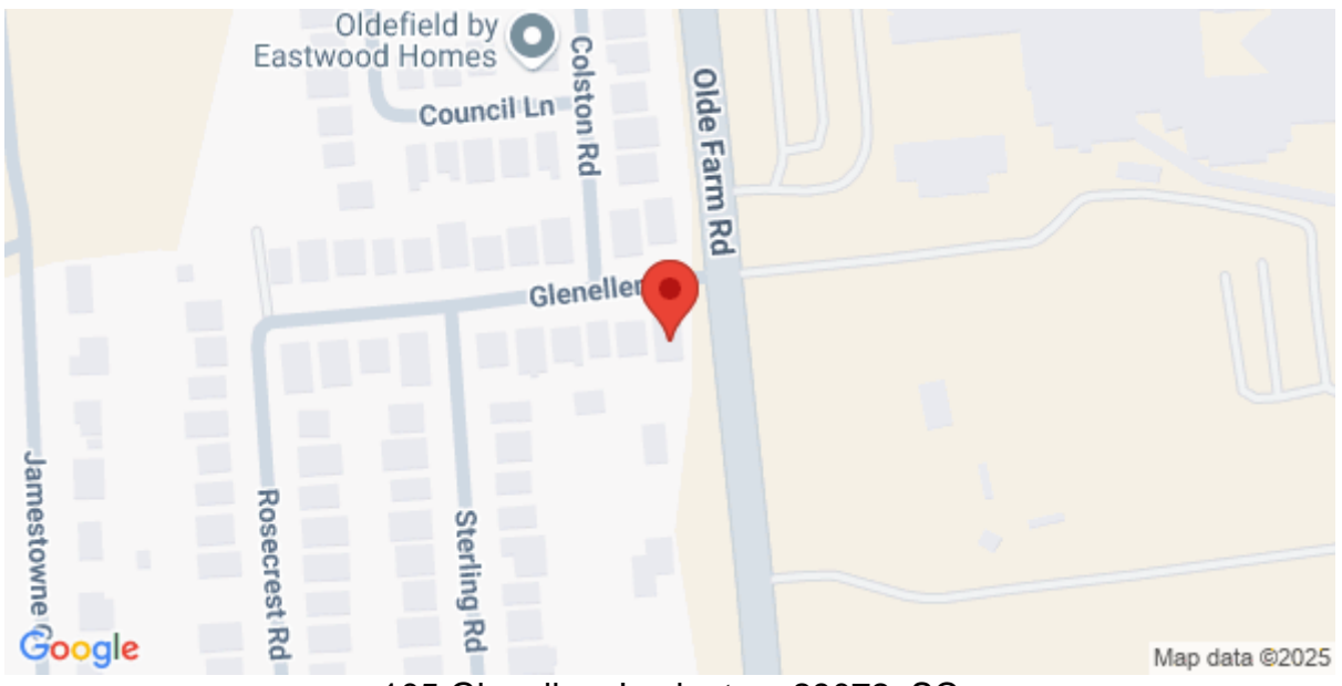
105 Glenellen, Lexington, 29072, SC