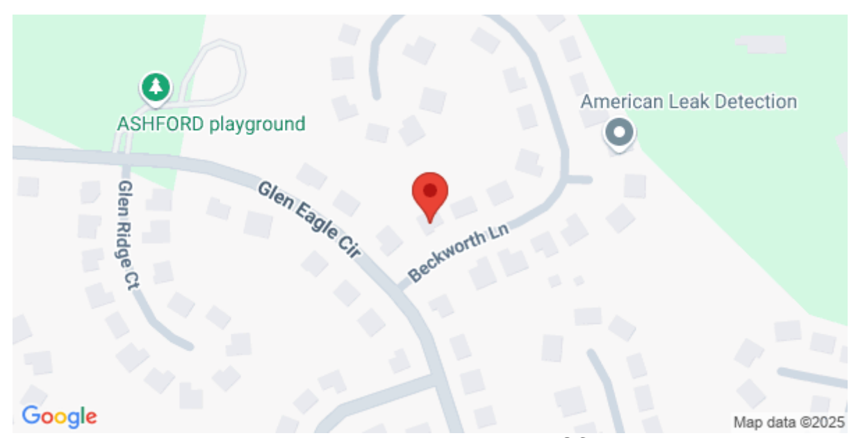
103 Beckworth, Irmo, 29063, SC