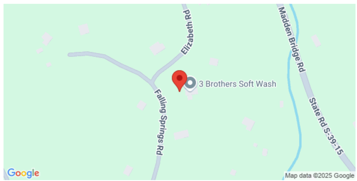
102 Penrose Circle, Central, 29630, SC